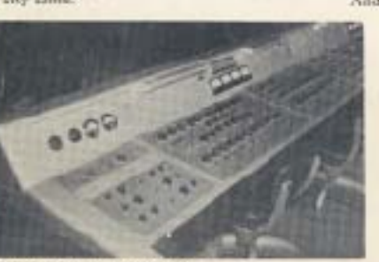
Master Control at Worner's

ABOUT VITAPHENIC STEWS. This is an outstanding Stephanic Steen occording every rate of which was originally eccorded live or multi-channel streenphenic becliniques. This recertling is a guaranteed original steen record, and not a pre 1555 conversion from other monautral masters. See your record dealer for complete information regarding the use of your stereophonic abonds taple equipment.